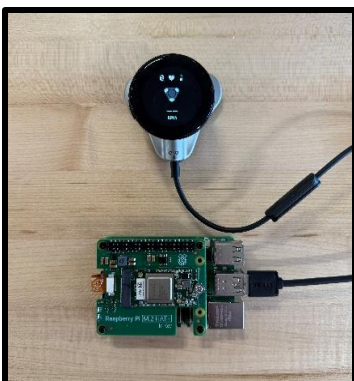
Raspberry Pi 5 & Digital Stethoscope