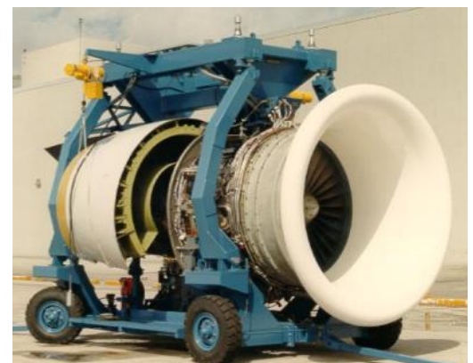
Big Bird loaded with Jet Engine