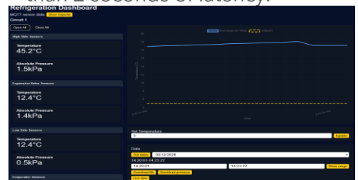
Website Display of Temperatures and Pressures